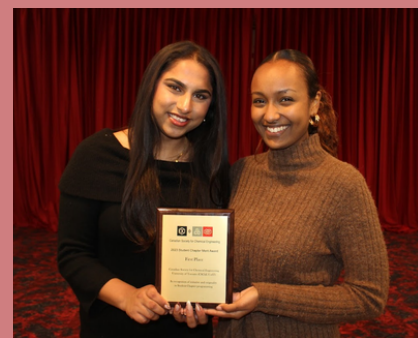
CSChe UofT : Student Chapter Merit Award